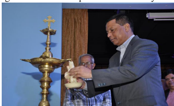
Lighting of the lamp by Chief Guest