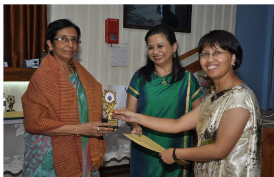
Chairperson Felicitating the Resource person