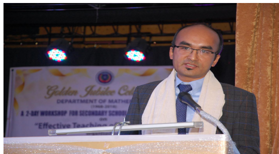
Speech by Chief Guest