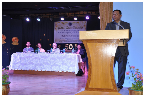
Chief Guest delivering his speech