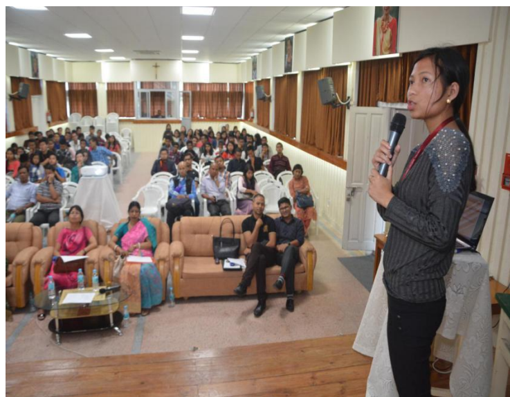
Student taking part in the Inter-College Paper Presentation competition