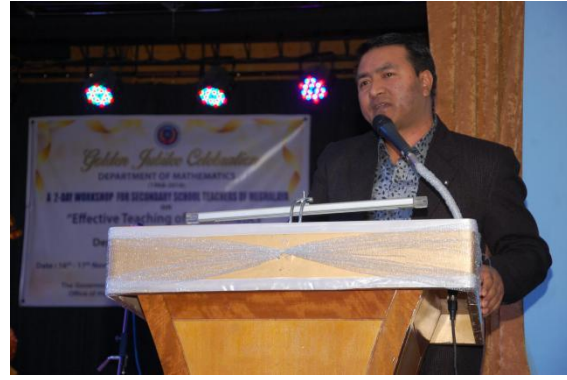
Speech by Chief Guest of valedictory function