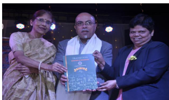
Release of Souvenir