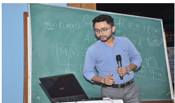
Participant presenting his paper