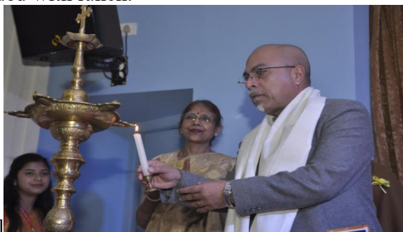
Lighting of the Lamp

The programme was attended by a large number of the teaching faculty and students which concluded with lunch.