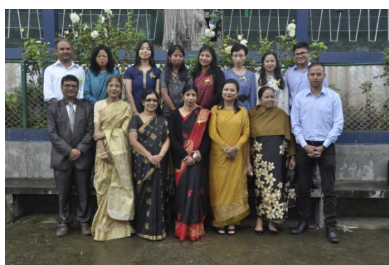
Former teachers and students along with present members