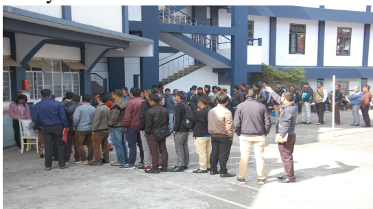
Registration of Participants