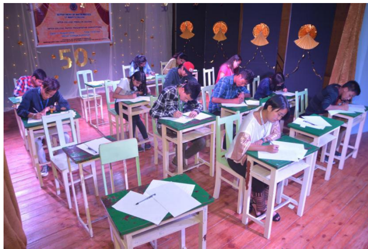
Students taking part in the Inter-College Problem solving competition